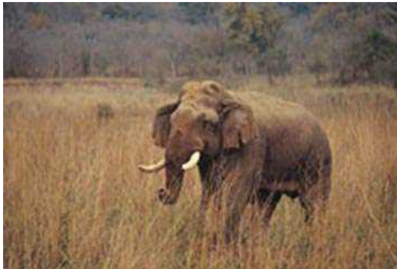
Fig 27.5: (a) Wildlife photography