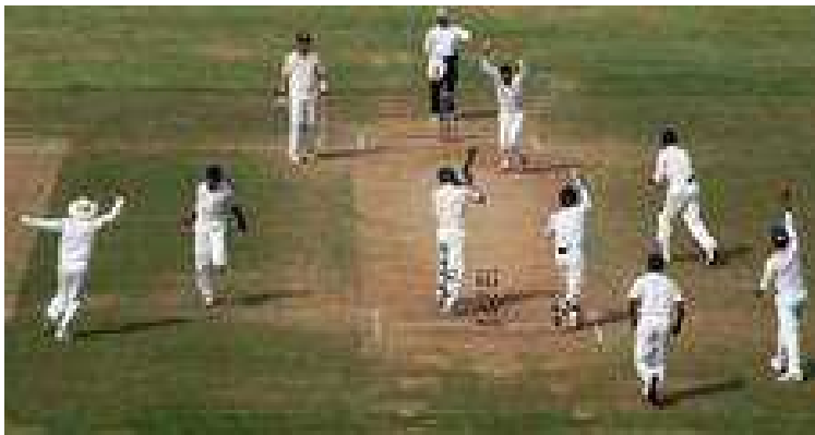
Fig 27.1 : (a) Sports photography