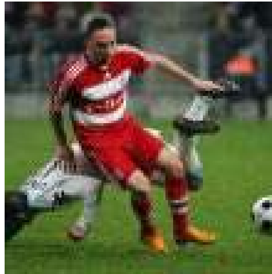
Fig. 27. 1: (c) Sports photography