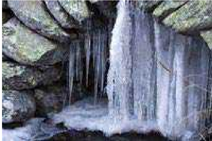
Fig. 27.4: Travel photography