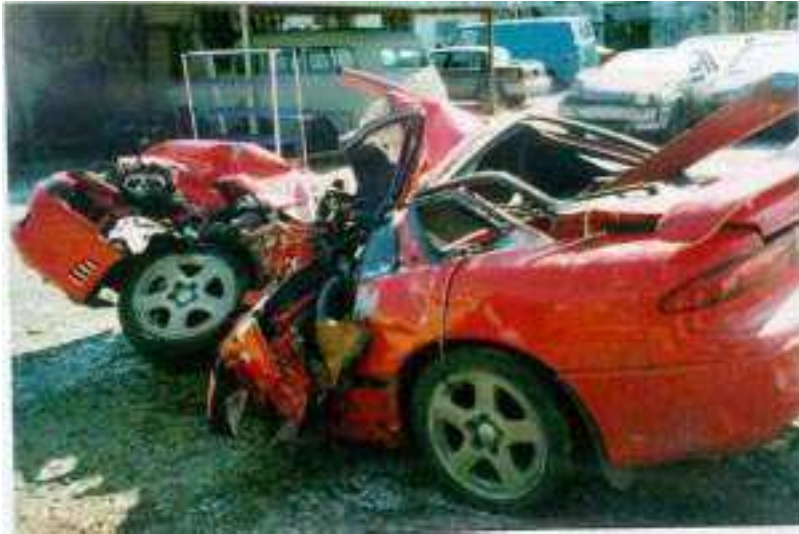
Fig. 27.3 : (a) Spot news photography