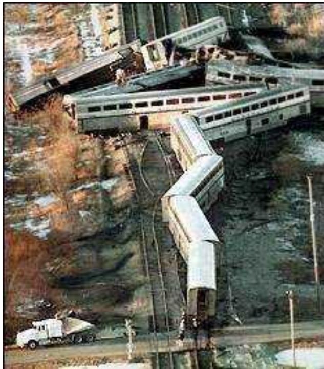
Fig. 27.3 : (b) Spot news photography