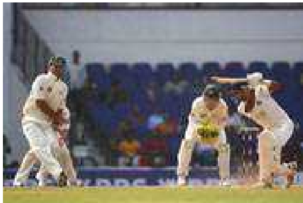
Fig 27.1 : (b) Sports photography