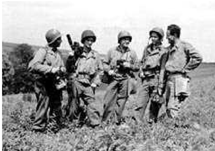
Fig. 27.2: War photography