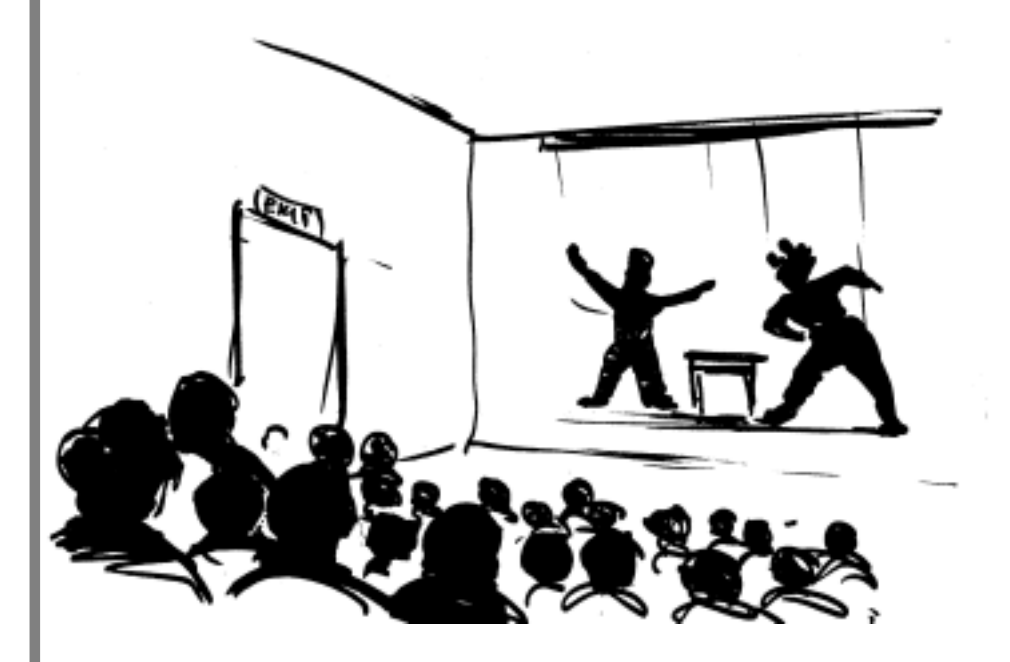
Fig.27.1: Watching a puppet show on a film screen

Traditional media continue to play an important role in our society. Ingredients of traditional media are given special projection in the mass media and as such traditional media are being used in development communication. You may recall what you have studied about development communication in the first module.