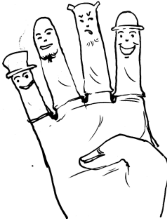
Fig 26.2 Glove puppet

Glove puppets are also known as sleeve puppets, hand puppets or palm puppets.