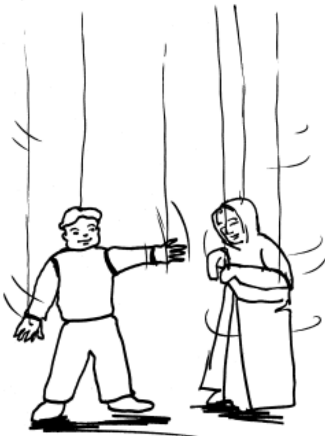
Fig. 26.3 string puppets

String puppets are found in Rajasthan, Orissa, Tamil Nadu and Karnataka. In this, the stress is more on the manipulative skills of the puppeteer. Have you ever seen a string puppet?