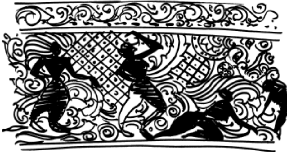
Fig. 26.6 wall paintings

Throughout different periods of history, we find a definite established tradition of painting on various objects, particularly on intimate objects of everyday use, floors and walls; and in almost every instance, the depiction being associated with some ritual.