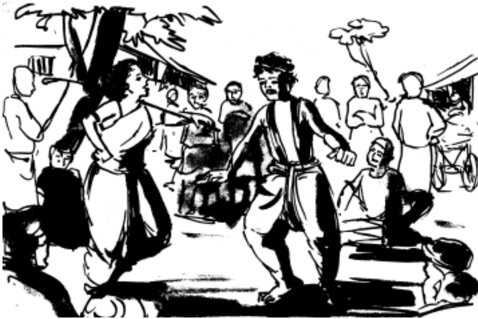
Fig. 26.1 street theatre performance

In such a situation, the audience and the performers are on the same level, emphasizing the fact that the performers are not different from the audience themselves. This also leads to the establishment of a rapport between the performers and the audience. Close eye-contact with the audience is an important element in street theatre which keeps them busy with the action of the play. Even an actor is under the eagle eye of the audience who surround him on all sides. So together they feel a sense of belonging and responsibility to each other. Sometimes the audience is invited to join the chorus for the singing.