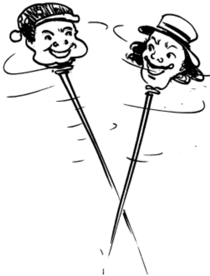
Fig. 26.4 Rod puppet

The traditional rod puppet form of West Bengal is known as Putual Nauch.