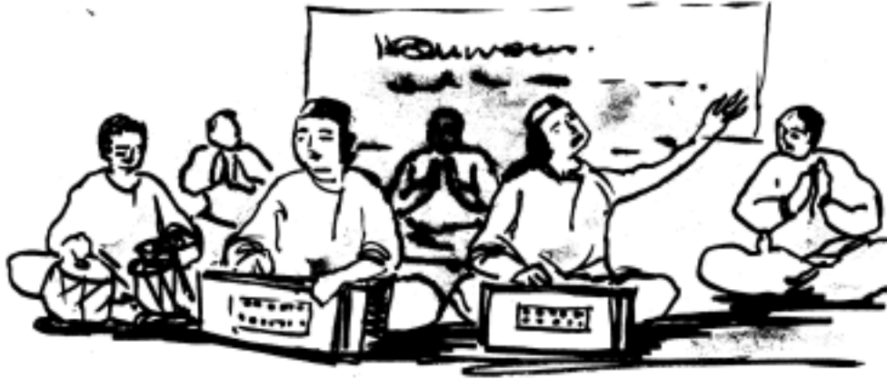
Fig. 26.5 qawwali

India and Qawwali emerged from the mystical sayings of sufi saints. The followers of Khawaja Moinuddin Chisti Garib Nawaz, the famous Sufi saint of Ajmer (Rajasthan) adopted and improvised Hindustani classical music into what is called qawwali. Despite originally having developed from mystical music, it later also began to include romantic themes.