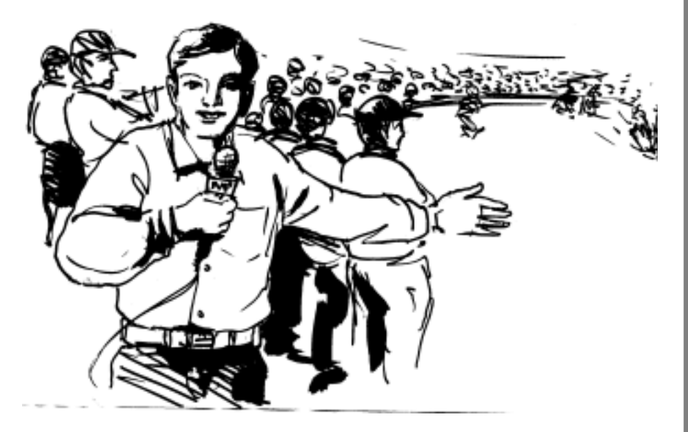
Fig.24.1: Reporting on a cricket match.

Those of you who gain some experience in the print media can think of joining the new media division of an established media organisation. These divisions are always on the lookout for good reporters, editors and writers. Reporters who work for new media not only pick up fresh story ideas for the web, but also follow up several important stories that have already appeared in the print edition.