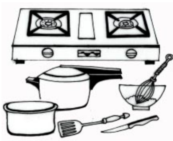
Fig. 16.2: Non-electrical equipment

(ii) Non-electrical: There is another category of equipments which do not need electricity to run. This category consists of kitchen utensils and tools, sewing machine, cooking stove, solar cooker, etc. These are manually operated. Some times, we can think of using