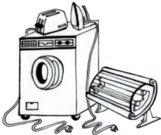
Fig. 16.1: Electrical Equipment

(i) Electrical: Look around your home and try to identify some equipments which need electricity to work. Which are those items? Yes, you are right! These are items like toaster, mixie, immersion rod, iron, refrigerator, washing machine, geyser, etc. which can work only with electricity.