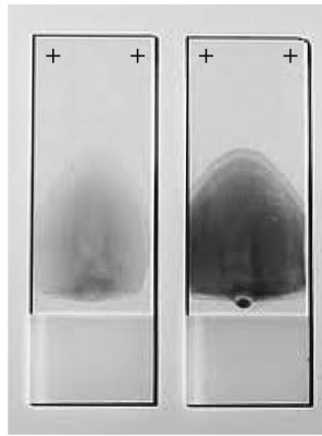
Fig. 9.2: Peripheral blood film before and after staining

The slides are fixed in methanol first. The stain is poured over the slide and kept for 20 min. the smear is washed as above.