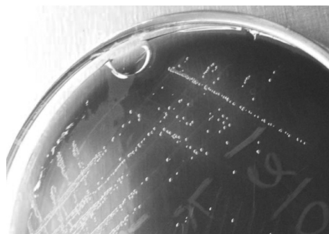
Fig. 27.4: Colonies of V Cholerae on TCBS

For the plating medias are – Bile Salt Agar, & TCBS