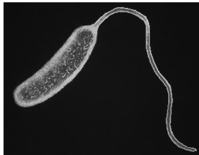
Fig. 27.1: Vibrio Cholera

Vibrios are Gram-negative, rigid, curved rods that are actively motile by means of a polar flagellum. The name 'Vibrio' is derived from the characteristic vibratory motility (from vibrare, meaning to vibrate). They are asporogenous and noncapsulated. Vibrios are present in marine environments and surface waters worldwide. The most important member of the genus is Vibrio cholerae , the causative agent of cholera. It was first isolated by Koch (1883) from cholera patients in Egypt, though it has been observed earlier by Pacini (1884) and others.