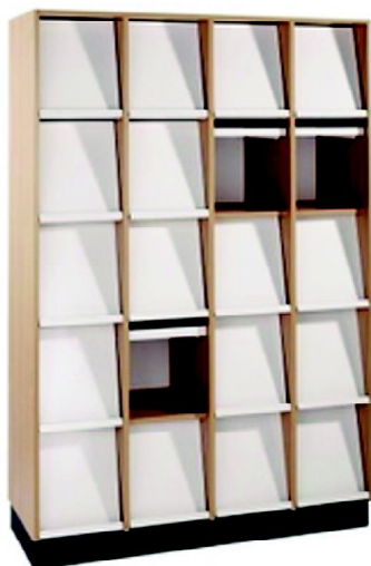
Fig.15.4: A Periodical Display Rack