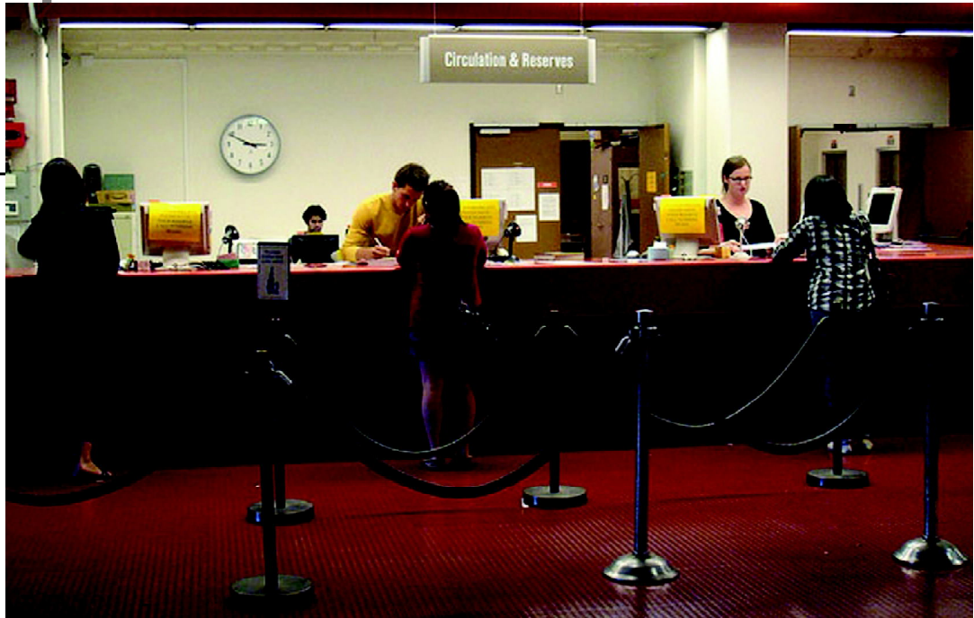
Fig.15. 3: A Circulation Counter