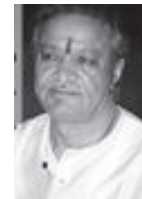
Hari Prasad Chaurasia