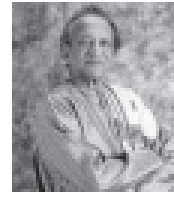
Pandit Ravi Shankar