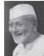
Ustad Bismillah Khan