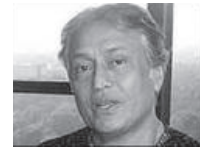
Amjad Ali Khan