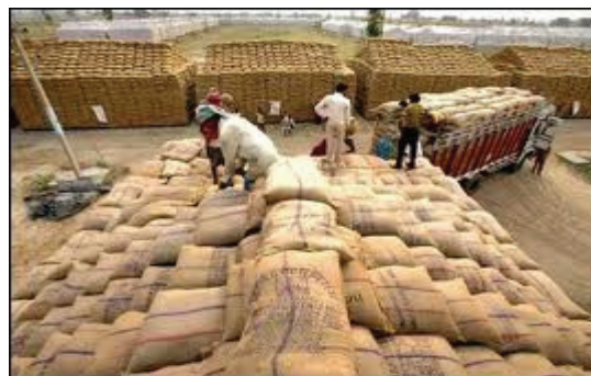
Goods in a Warehouse

is it possible? Here storage of sugarcane in sufficient quantity is required. Again, after production of sugar it needs some time for sale or distribution. Thus, the need for storage arises both for raw material as well as finished products.