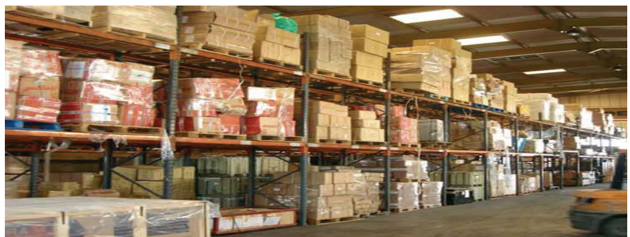
Goods Stored in a Warehouse