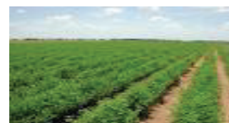
An Agricultural Farm