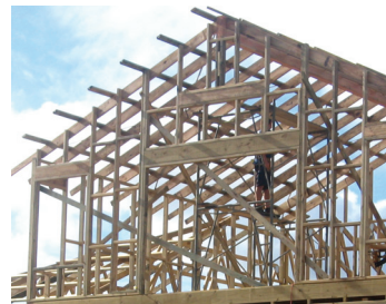
A Building under Construction