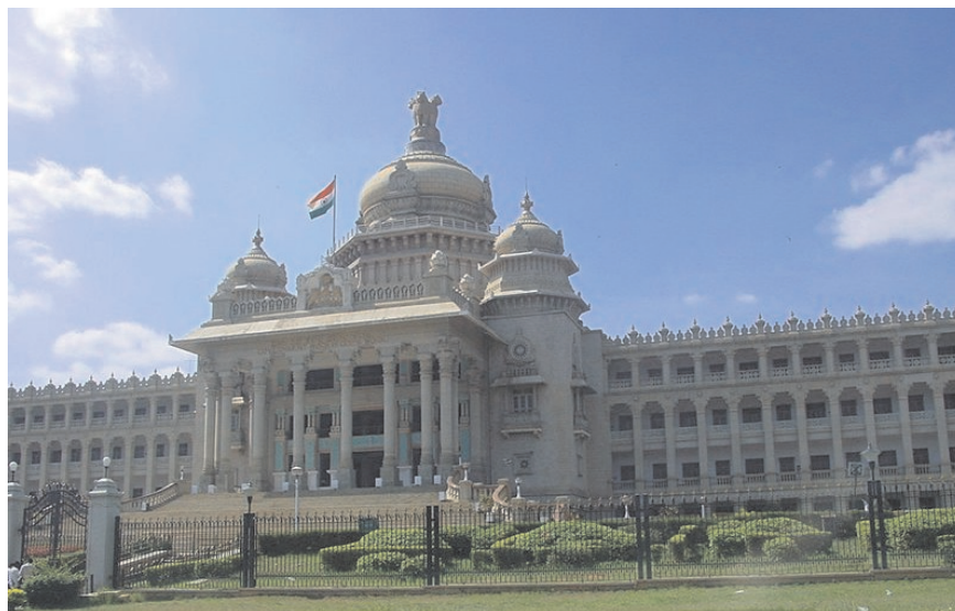
Figure 19.2 Vidhan Soudha (Vidhan Sabha) Bangalore

Every State has its Legislature. You are seeing below the building of the State Legislature of Karnataka. Let us understand how the State Legislatures are constituted. In some of the States the Legislature is bicameral i.e. has two houses. In most of the States it is unicameral i.e. has only one house. The Governor is an integral part of the State Legislature. The unicameral legislature has the Legislative Assembly and the bicameral has the Legislative Assembly being its Lower House and the Legislative Council the Upper House. At present only Bihar, Jammu & Kashmir, Karnataka, Maharashtra and Uttar Pradesh have bicameral legislatures and the remaining 23 States have unicameral legislatures.