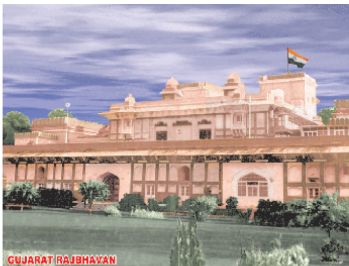
Figure 19.1 Raj Bhavan, Ahmedabad

system. At the state level, there is a Governor in whom the executive power of the State is vested by the Constitution. But the Governor acts as a nominal head, and the real executive powers are exercised by the Council of Ministers headed by the Chief Minister.