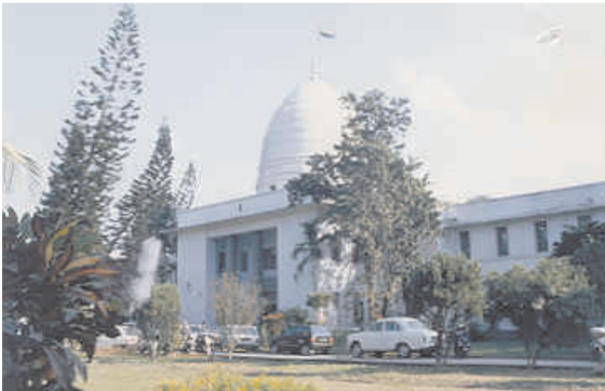
Figure 19.3 High Court, Guwahati