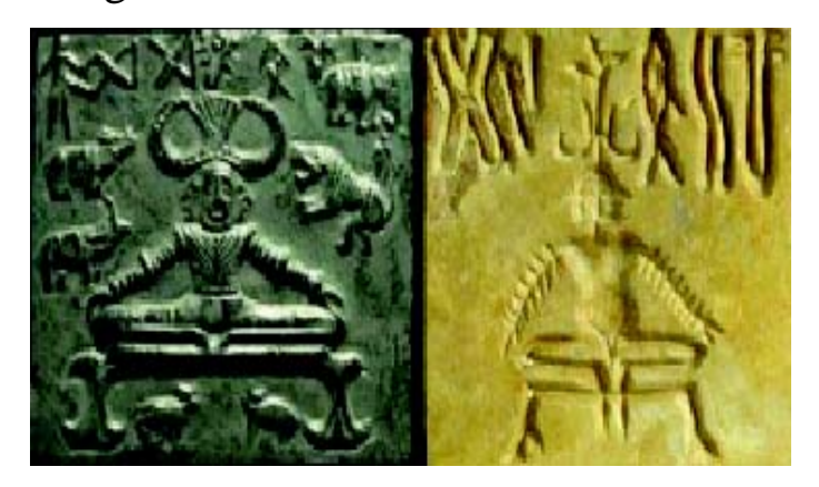
Fig. 1.1 Ancient seals related to Yoga.

The development of yoga can be traced back to over 5,000 years ago, but some researchers think that yoga may be up to 10,000 years old. The science of Yoga has its origin thousands of years ago, long before the first religions or belief systems were born. In the yogic tradition, Shiva is seen as the first Yogi or Adiyogi, and the first Guru or Adi Guru. The Number of seals and fossil remains discovered in Indus Saraswati valley civilization show yogic activities and figures performing Yoga, suggesting the presence of Yoga in ancient India.