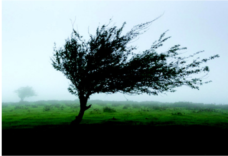
Fig. 2.2 Wind

Wind- The origin of air is assumed to be from the sky. “आकाशद्वायुः” air is also considered to be eternal. The air has its own property of touch and the quality of the sky shabd. In this way the two properties of air - touch and word are everlasting.