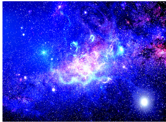
Fig. 2.1 Sky

Sky- The sky has been considered to be eternal. One of the properties of the sky is- shabd. Just as the sky is eternal, so is its property - "shabd" is also everlasting.