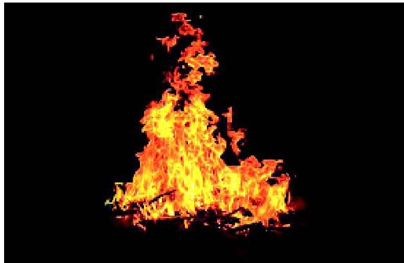
Fig. 2.3 Fire

Fire is considered to be “वायोराग्नि”. Fire has three properties of