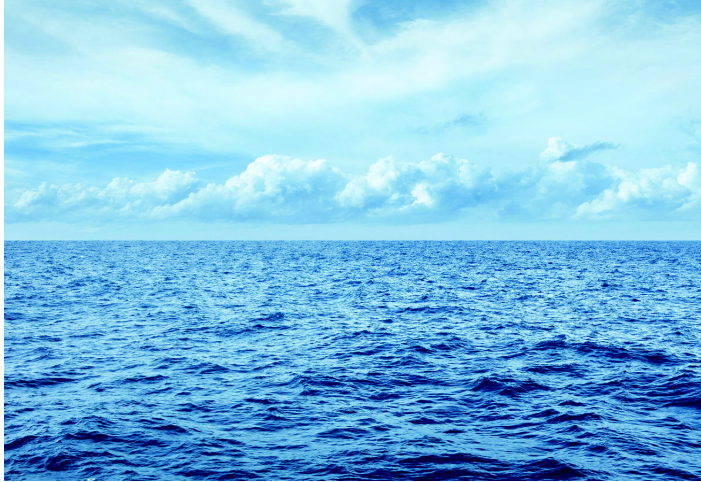
Fig. 2.4 Water

Water has shabd, touch, form and taste properties. All four properties are eternal.