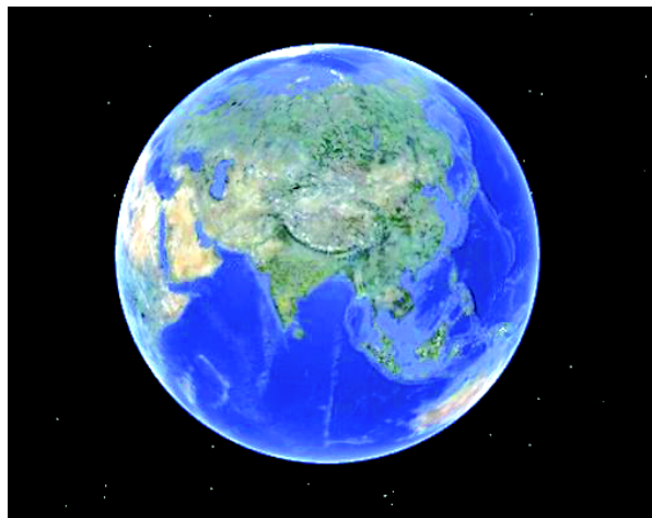
Fig. 2.5 Earth

Earth- Earth is believed to originate from water. Amazing earth. shabd, touch, form, taste, smell are the five properties of earth.