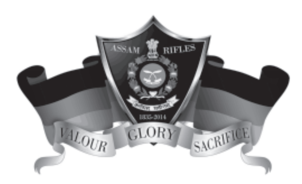
Fig.18.2 Assam Rifles Logo

The Force is a potent organization with 46 battalions and its associated command and administrative back up. It is designated by the GoM committee as the Border Guarding Force for the Indo - Myanmar border and is also its lead intelligence agency. Look at the logo of the Assam Rifles given below.