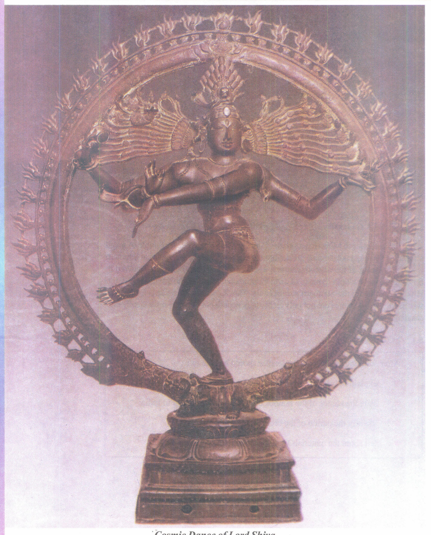
Cosmic Dance of Lord Shiva