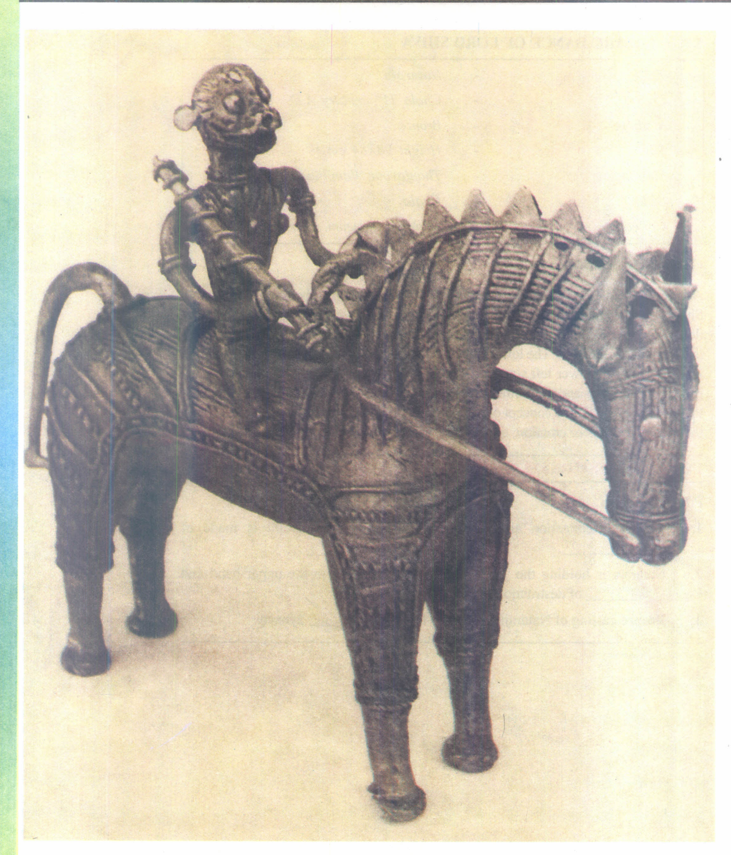
Dokra casting (Tribal Bronze casting)