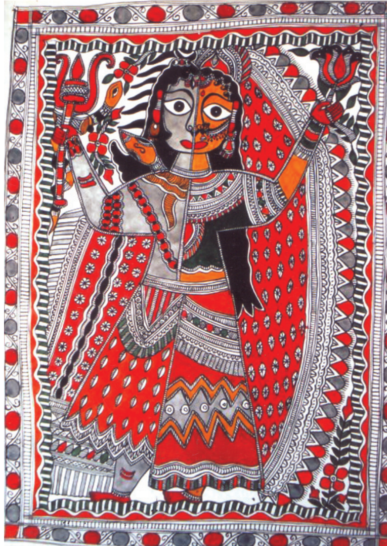
Fig. 1.4: Ardhanariswara, Madhubani Painting

(Harijan). The people of Mithila are highly religious, and they are quite naturally influenced by the worship of Shiva, Shakti and Visnu. Goddess Durga worshipped as 'Istadevi,' The subject matter of any Madhubani Painting is governed by the occasion, and fresh painting is painted for every occasion.