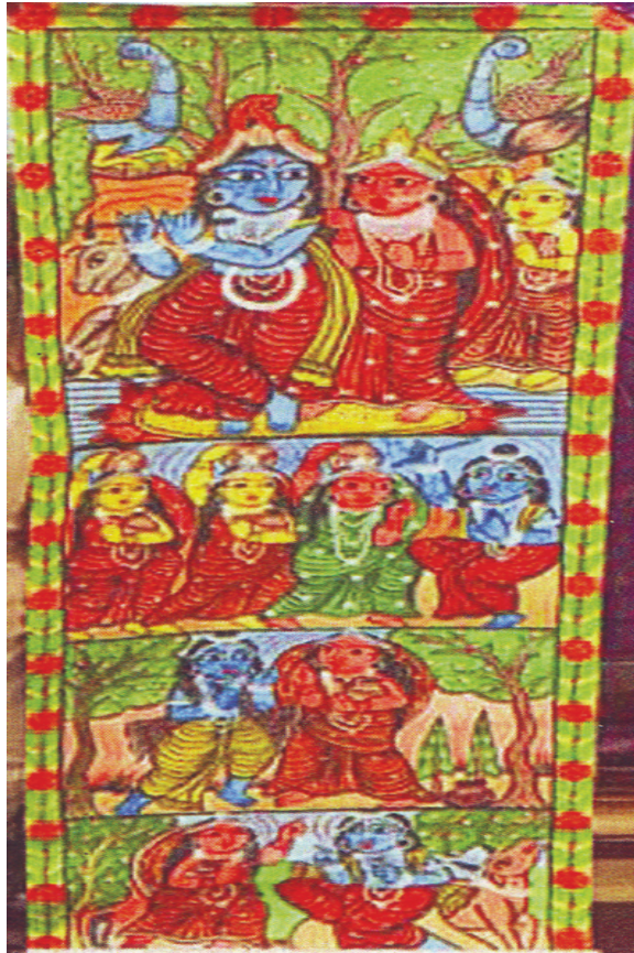
Fig. 1.3: Jadupat

This Jadupat is a specialized painting of the Santhals of West Bengal. This community is the third largest tribe in India. It largely inhabits West Bengal, Bihar, Orissa, Madhya Pradesh, Jharkhand and Chattisgarh. The painters are known as 'Jadupatua.'