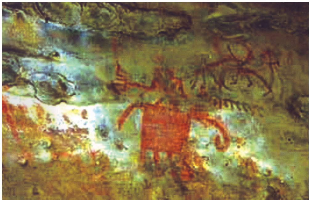
Fig. 1.2: Jogimara

You know that prehistoric rock painting in India entered protohistoric era through Zhob, Aamri, Nandra, Nal, Shahi Tump, and Harappa-Mahenjodaro in Pakistan periods. In the cave of Jogimara of Ramgad hill of Surguja, Chattisgarh some paintings were discovered. Experts have suggested that these paintings may be dated as of the paintings of the historical age. These are 'Fresco Paintings'. Here a plaster of lime and sand or other materials is layered on the stone or wall. On that wet plaster, artists make drawings and colour it after it dries up. Then, finally, it becomes a permanent painting.