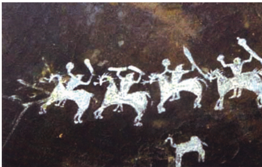
Fig. 1.1: Bhimbhethka

throwing sticks, clubs, harpoons, bows and arrows. Increasingly we find pictures of confrontations between men and wild beasts, that is to say, hunting scenes, and early allusions to animistic practices in different shapes.