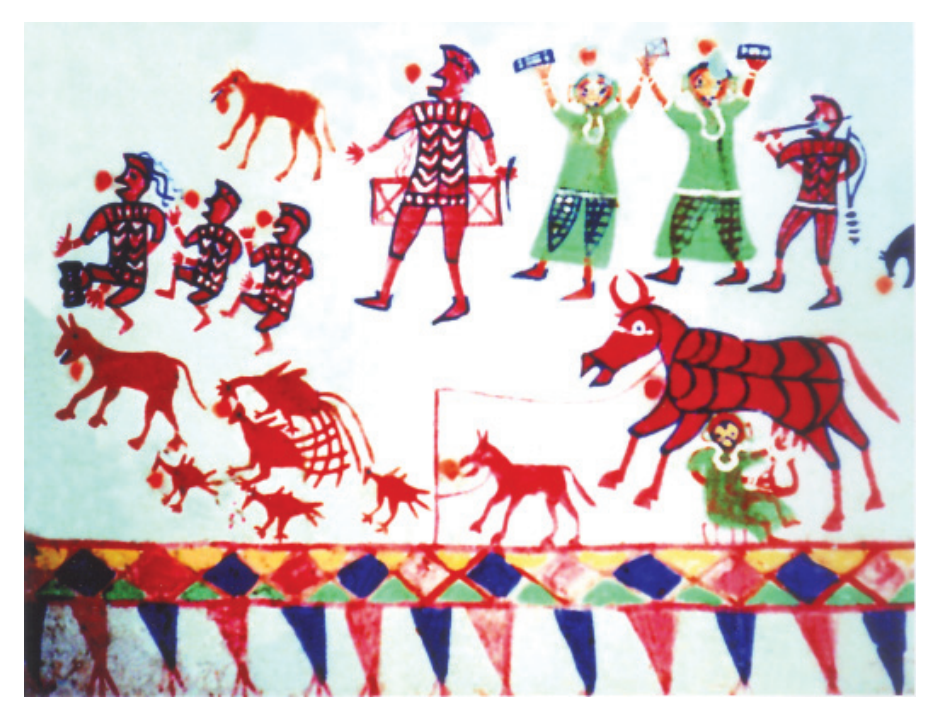
Fig. 4.3: Traditional Pithra Motifs

On the left side of Pithora, farmer's plough ox is made, which symbolizes farming. Two hunters carrying the body of a dead lion on sticks in Pithora gives evidence of a cave painting. Supad Kanya is a woman with long ears, and one-legged man represents the disabled people of the village. In every village, a bull is released for the fertilization of cows which is called 'Handya Saand'. The bull shape is made in the Earth portion of Pithora. Many images are also seen outside the Pithora house. Some beginner level Likhandras or other amateurs make images on the space left around the Pithora wall in which birds, animals, vegetation etc., are made.