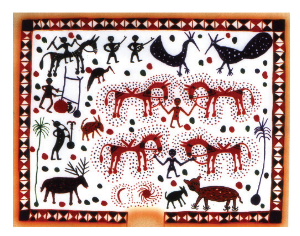
Fig. 4.1: Traditional Pithora motifs

the form of lines. A serpent or stick is shown in the hands. It is usually made of white colour.