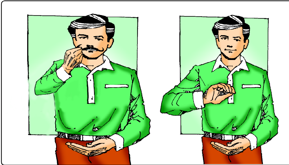
Figure-9.1: MALE + BORN = SON