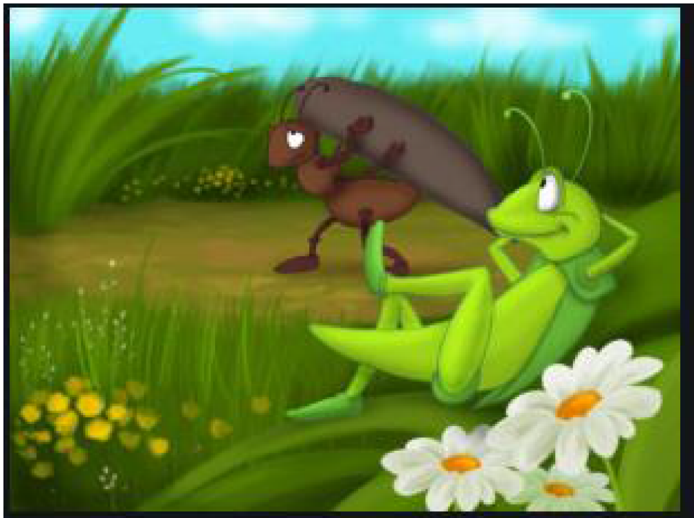
Figure-12.2 : Moral Stories

Many ISL stories are aimed at young children and among these stories, moral stories and fables, which teach the basic truth about life, are some of the most popular. This is also true for hearing children in India. These stories are good for promoting important social values.